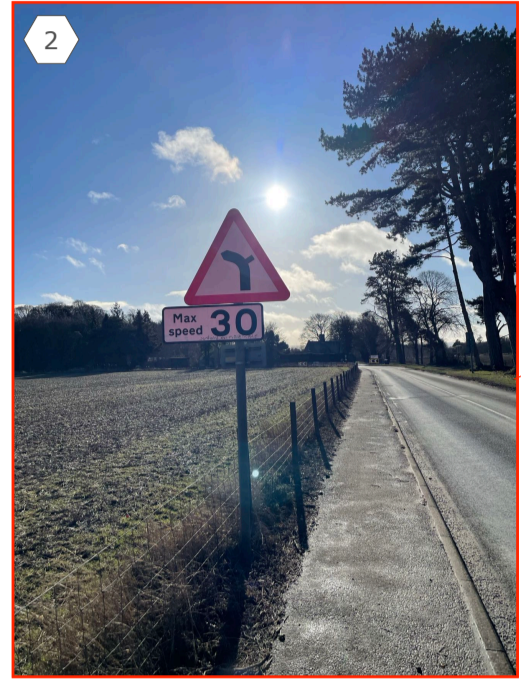
Looking South West as the A939 approaches the Househill bend from Nairn. The Househill bend is marked with a 30mph speed limit. Travelling in the opposite direction, this bend has no speed restriction.