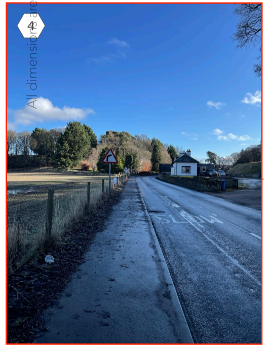
Looking South East as the A939 approaches the locally known 'big wall' bend travelling through Househill towards the Househill Business Centre. Unlike traffic approaching the 'big wall' bend travelling towards Nairn, no 30mph limit is advised for this tight and blind bend