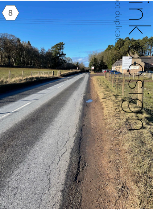
Looking back towards the proposed site entrance and the Househill Business Centre from 40m beyond the Househill Business Centre at the sight of the proposed extension of the Nairn 30mph signed limit.