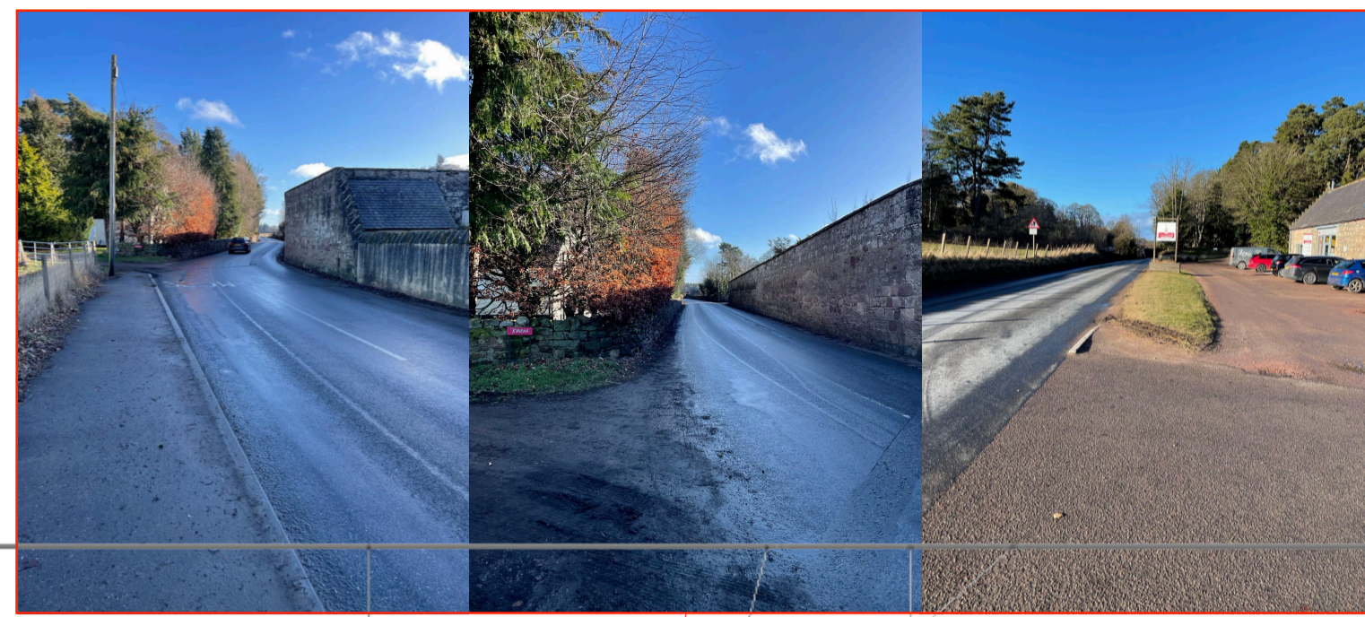
Approaching the end of and leaving the footpath to make the walk along the width restricted section of the A939 as it passes the locally known 'big wall', and a reverse look into the pedestrian section returning from the Househill Business Centre (Cafe, farm shop, hair salon, Netherton Tractors, Househill Floors, and Loch Ness Furniture). The road here measures 6720mm wide (wall to wall, excluding eroded/covered carriage way markings). There is no pedestrian refuge either side. This is insufficient for a pedestrian, and two cars to safely pass. The blind corner has no widening for heavy vehicle traffic. Anecdotally, whilst undertaking this survey our surveyor was caught in this two car situation, which resulted in two emergency stops as the south travelling vehicle emerged from the blind bend to find a pedestrian and car approaching from the south.