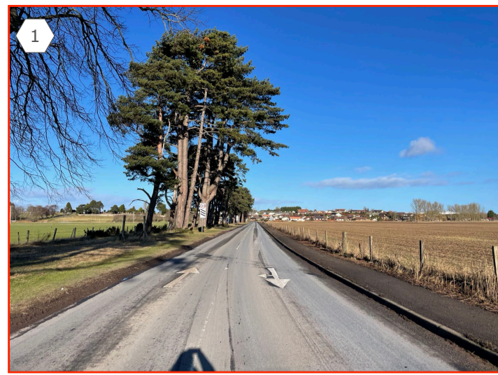
Looking North East as the A939 approaches Nairn and the 30mph speed limit countdown starts