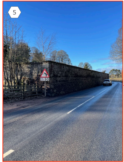
Looking North West as the A939 approaches the locally known 'big wall' bend travelling through Househill towards Nairn. Unlike traffic approaching the 'big wall' bend travelling from Nairn, the bend is limited to a 30mph limit