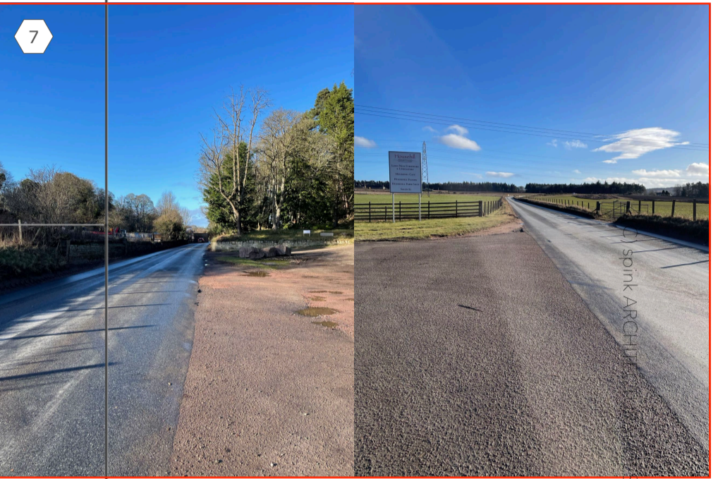
Looking out of the Househill Business Centre onto the A939 visibility splays. As a national speed limit section of road, the visibility splay looking North West would extend beyond the 'big wall' and associated blind corner.