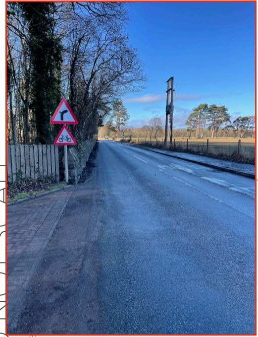
Looking North West as the A939 approaches the Househill bend travelling towards Nairn. Unlike traffic approaching the Househill bend from Nairn, no 30mph limit is advised for this very tight bend